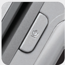
Voice-Activated Dialing Key